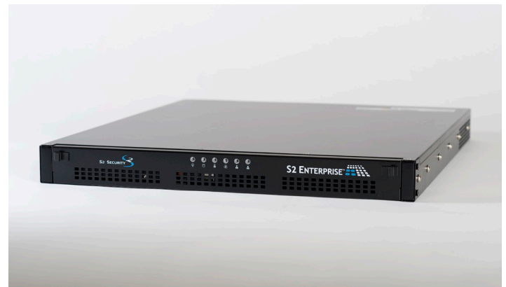
The S2 Enterprise Select (shown) and S2 Enterprise Ultra fit standard 19" racks

Two models are offered for maximum flexibility. The standard S2 Enterprise offers the benefits of higher processing speed, as well as increased device and user capacity in a value-priced package. The S2 Enterprise Ultra includes a faster processor and larger RAM array, and