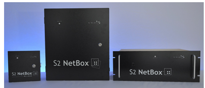
Several enclosure options are available for S2 NetBox systems.

Software for the entire system is embedded in the network controller. Updates are delivered online and completed in a single operation. Data storage is provided in flash ROM, removable compact flash, disk,